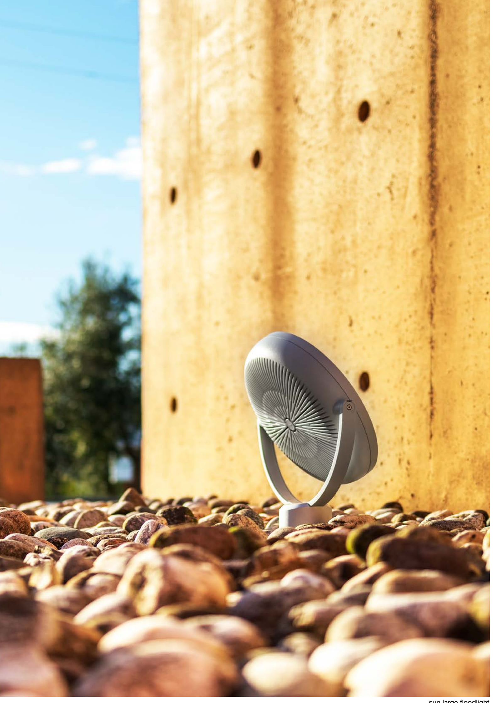
sun large floodlight

A family of floodlights designed by the Lundbergdesign Studio, in various sizes and wattages, with white or dynamic light, suitable for meeting any outdoor lighting design requirement. The design is strictly technical in feel, with decidedly captivating aspects. Form and function are clearly identified and come together perfectly in the defined changes of surface finish and materials. Of particular note: the technological equipment is designed to show off the optics to best effect.