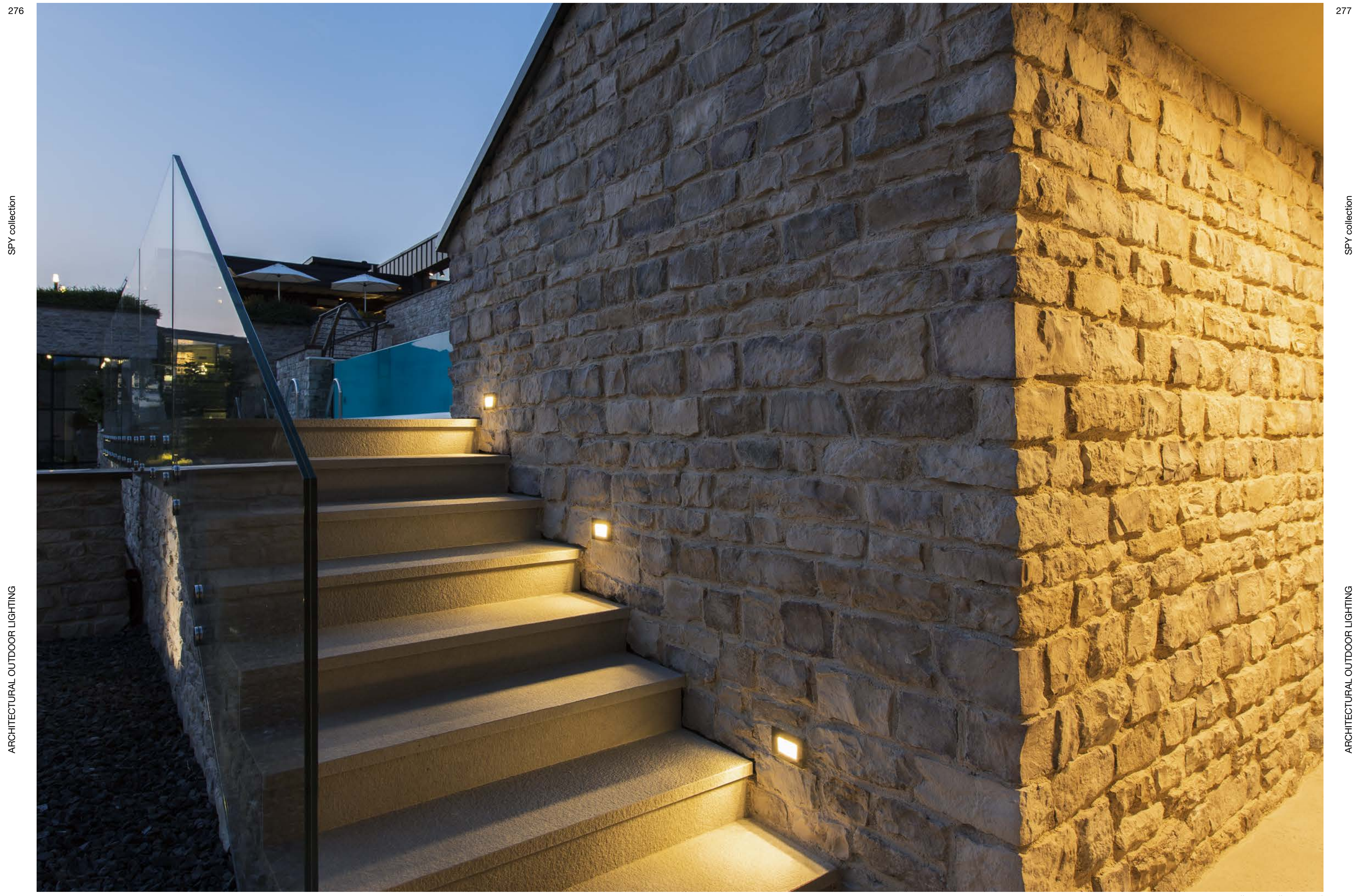
spy medium - wall recessed